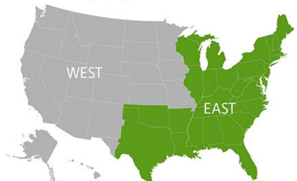
TRICARE EAST (New)